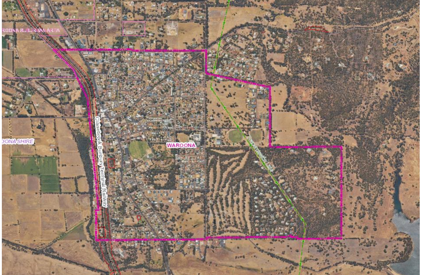
Figure 1: Waroona townsite boundaries in pink

6.4 Location and land use permissibility