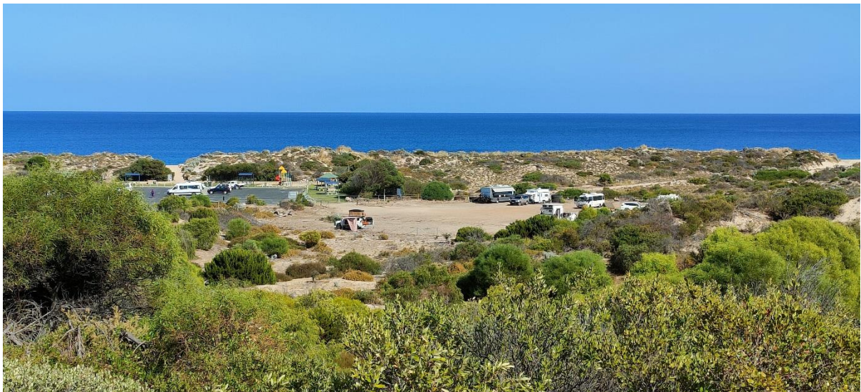
Figure 6. Ocean view from viewing platform