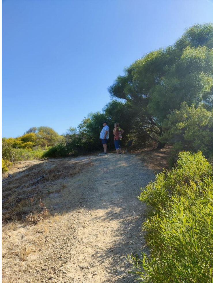
Figure 5. Pathway to seating / viewing platform area