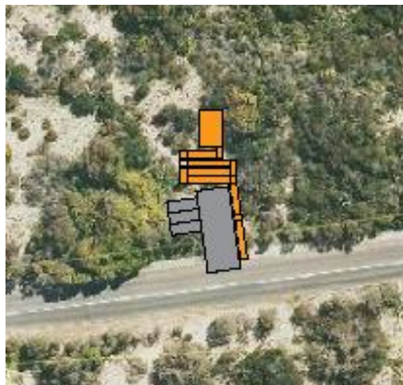
Figure 2. Mitchel Road disability car park, boardwalk and viewing platform