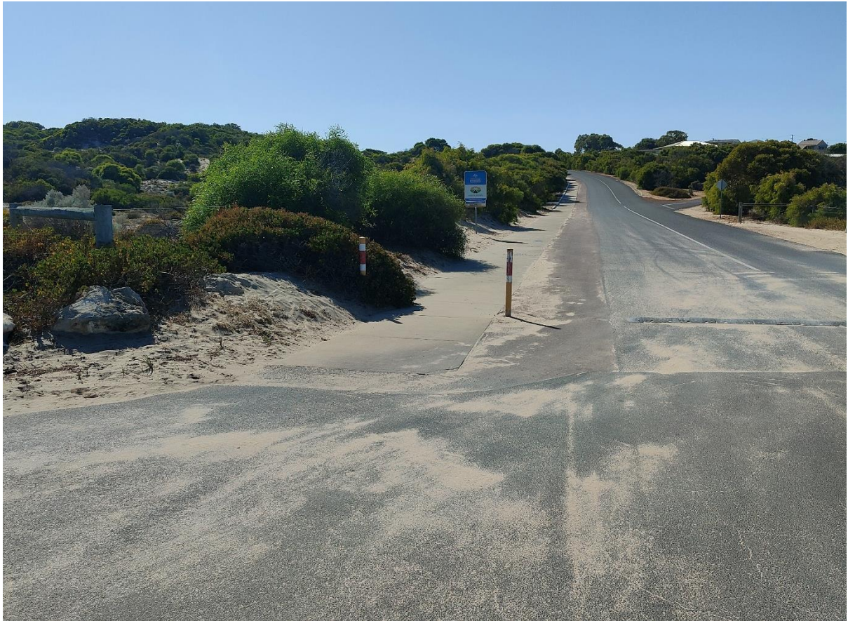
Figure 3. Dual use path from car park up to Option 3B Mitchell Rd viewing platform area