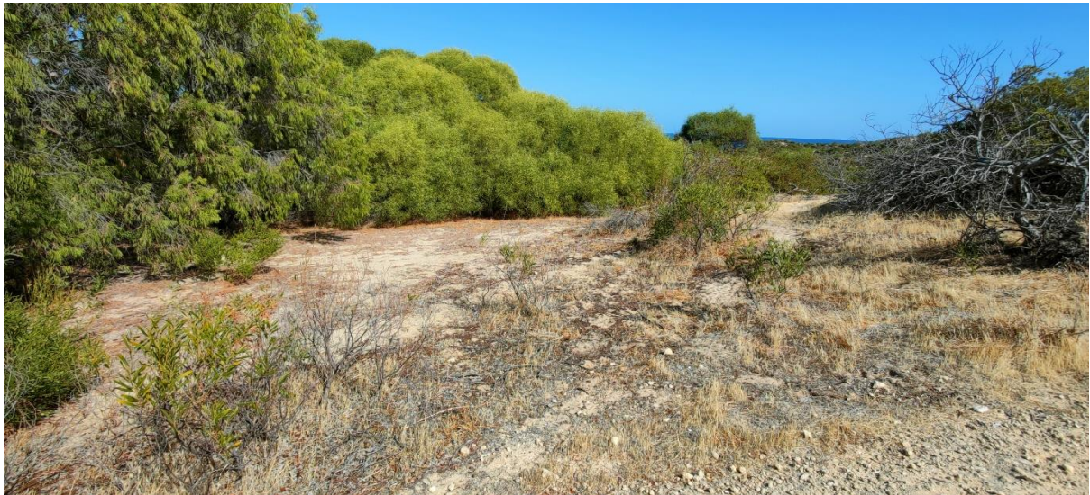
Figure 4. Disability Parking area within 10m of Mitchell Road.