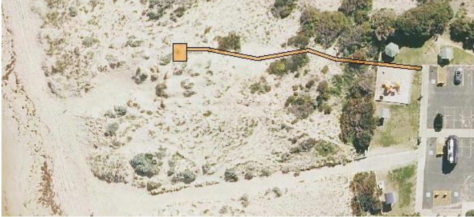
Figure 1. Option 3E site plan for viewing platform

In this option a boardwalk connects from the car park area to a location in the dunes north of the beach access track, suitable for viewing the ocean. A preliminary design for this option has been developed previously.