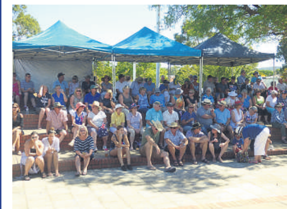
Just under 300 community members braved the heat to attend the official Australia Day ceremony.

At the last Council Meeting in December, Council agreed to adopt the latest version of the Strategic Community Plan as presented. The report from the consultancy firm, who were engaged to undertake community consultations in October 2016, has been analysed. However there are too many specific items raised to be summarised at this time. Many responses proposed that the Council embark on new projects, but some are beyond Councils area of responsibilities, while others are obviously unaffordable, particularly in the light of the reduction in State Government funding. Some of the more practical items could be