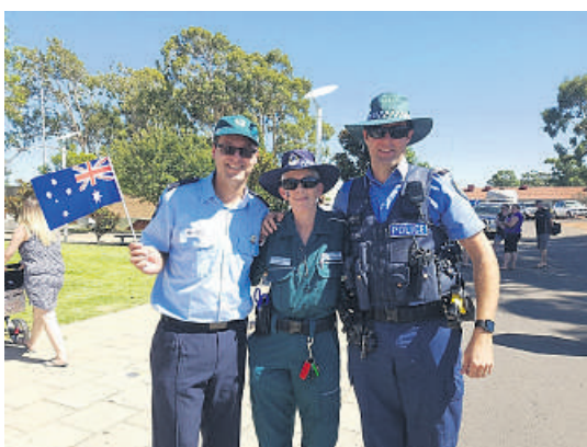
Local Fire, Ambulance and Police Officers Swap Hats for the day