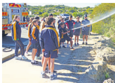
Mandurah Baptist College students operating fire equipment

The Annual Preston Beach Dune Restoration Project community planting day was held on Wednesday 28th June, with over 130 students from Mandurah Baptist College in attendance. The project once again was a huge success with support from Preston Beach Progress Association, Preston Beach Volunteer Rangers, Preston Beach Volunteer Bush Fire Brigade, St John Ambulance and Police, as well as community members and residents of Preston Beach.