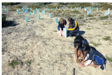
Students from Mandurah Baptist College participating in the Annual Preston Beach Dune Restoration day by tree planting

The Shire of Waroona would like to thank the Department of Planning Coastwest Funding for their ongoing support of this wonderful community project.