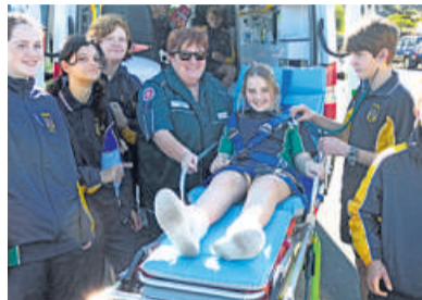
Mandurah Baptist students with Volunteers Ambulance officer.

On a beautiful winter's day, over 600 native coastal seedlings were planted around the main carpark, including a weed and litter pick up across dunes adjacent to the area. The students had a go on the fire hose, were handcuffed, breath-tested and strapped to the ambulance trolley. At the end of the day they participated in a sandcastle competition.