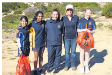
Shire of Waroona ETO with Mandurah Baptist Students at the Preston Beach Dune Restoration Day.