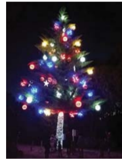
Town Christmas Tree shines brightly for the second year

On Sunday, 3rd December, the Town Christmas Tree was turned on as part of the second Turning on the Lights ceremony. Leos Club of Waroona sold sausage sizzles and drinks, and Waroona Youth Advisory Council handed out FREE lolly bags. Santa stopped by for a visit and was instantly overwhelmed by the kids. It was great to see so many community members