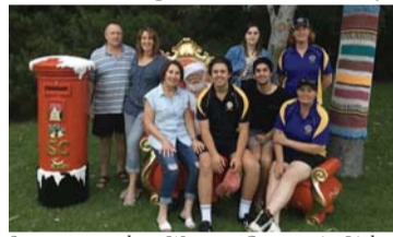
Santa congratulates Waroona Community Lights Committee with supporters of the project

come down, have a bite to eat and drink, mingle with others and witness the tree being lit for the second time! If you haven't already seen it, make sure you head down to the Visitor Centre and check out the lights.