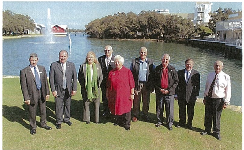
• Officials from the nine Local Governments at the partnership release.

At the PNP's Annual General Meeting in Mandurah on 17 May 2013, the partners agreed to delegate these findings to the State Government,